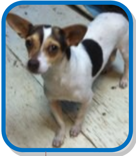
JIFFY-RESCUED FROM GAS CHAMBER