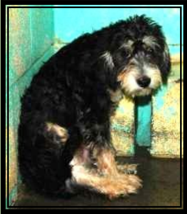
BAXTER IN SHELTER