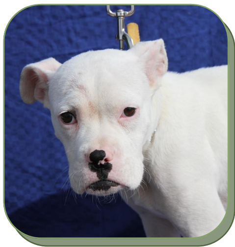
BY: HEATHER SCHOBER