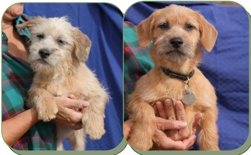
BY: SHELLY WRIGHT