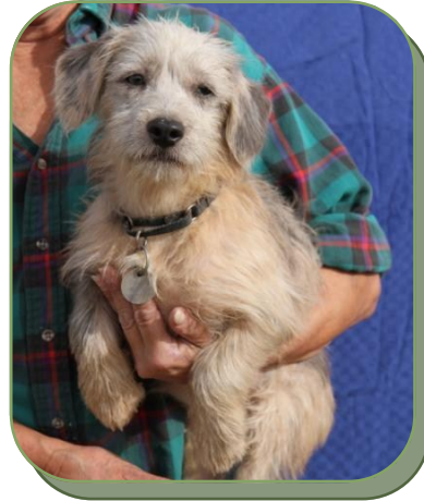
BY: LORI LANDERS