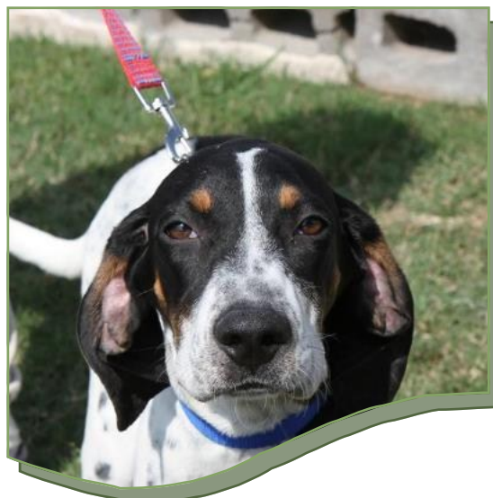
BY: ERIN RILEY