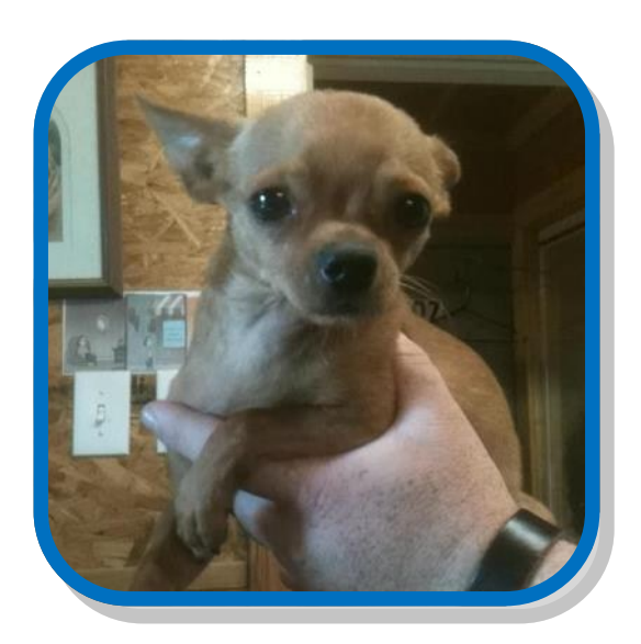
JIFFY-RESCUED FROM GAS CHAMBER