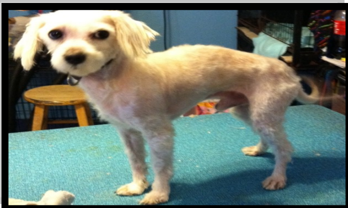
Paddy in April.

YOUR DONATION IS TAX-DEDUCTIBLE. PLEASE VISIT US AT WWW.NABS-TX.COM .