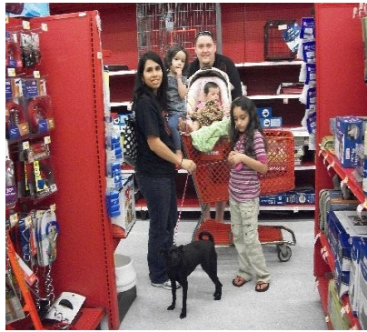
Chiquita By Kody & Leticia Allred