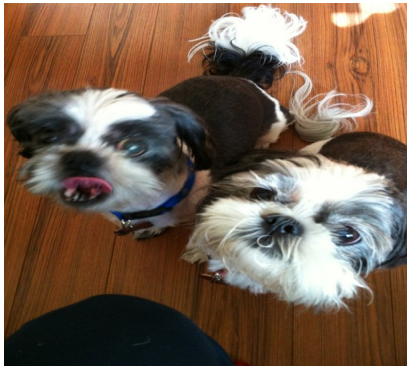
Gizmo and Buttons 12 yr. old Seniors.