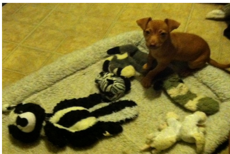
Thelma rescued from a gas chamber in March—Thelma thriving and Happy w/toys!