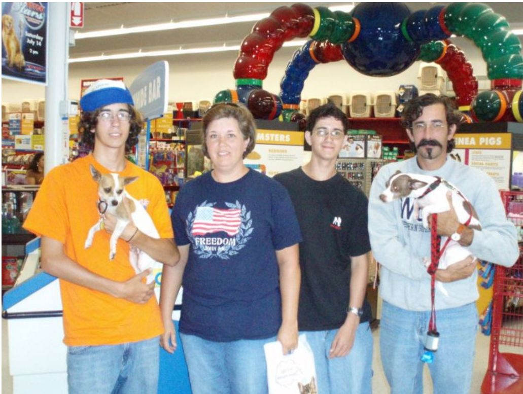
Spunky and his new brother Jelly Bean