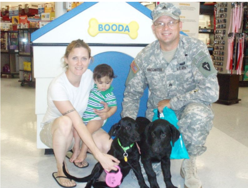
Shasta and Simba