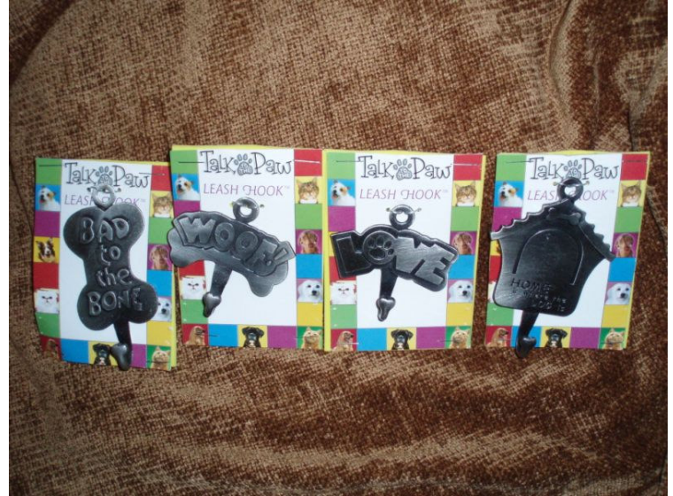
Leash hooks, $5.00