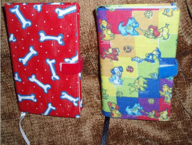
Address books, $5.00