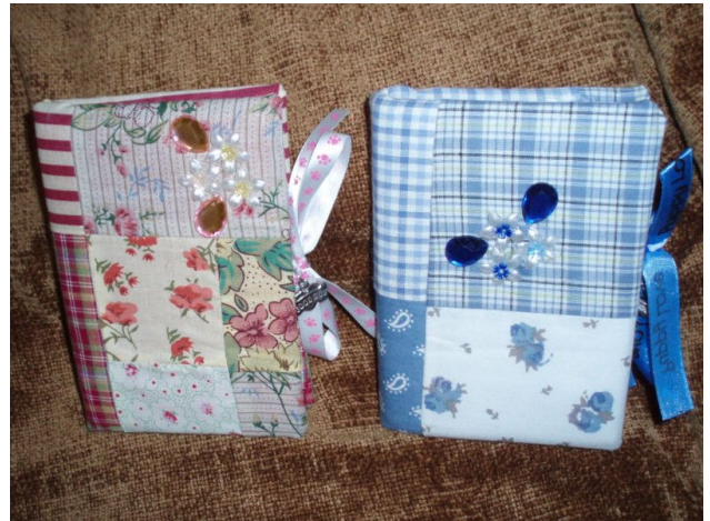
Mini Journals, $10.00