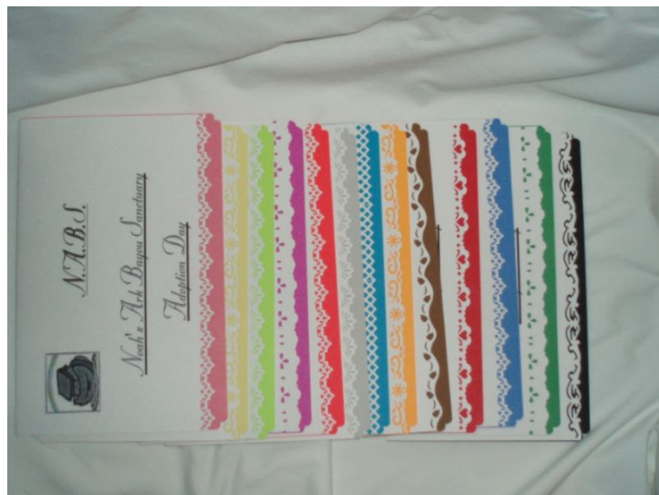
Adoption photo and holder, $5.00