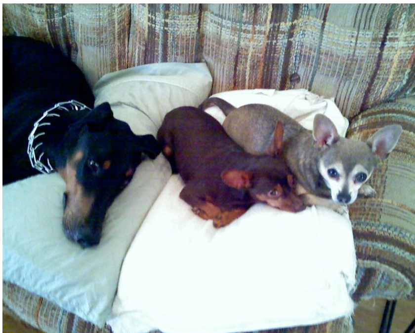
Desi (in the middle)