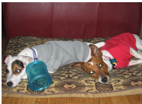
Time for a dog nap.