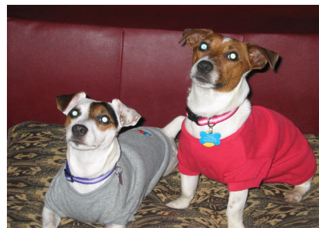
Ooo, ooo—is that a treat?!

Please share your Furry Children's stories with us. You may email your story and pictures to marybruner@yahoo.com. Due to limited space, submissions may be moved to a later issue.