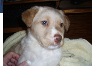
Churchill being a good boy