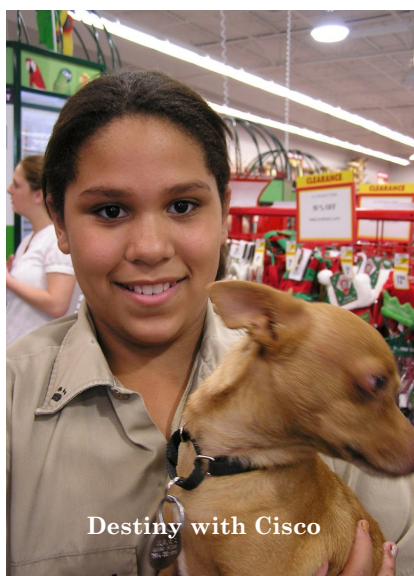
Destiny with Cisco