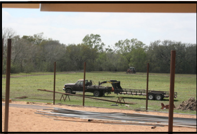
Angle irons being welded to poles for fence panels to be supported on