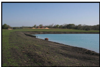
Another view of the pond with containers in background