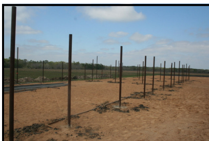
Looking down the row of poles for the five pens on this side of pad.