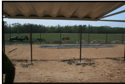
View from inside container looking out at poles for the pens.