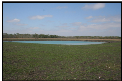
The wide open spaces