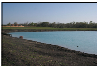
Resident duck enjoying the pond. Containers in background.