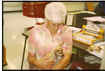
CLOVER AND FAMILY