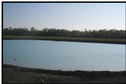
Just more scenery