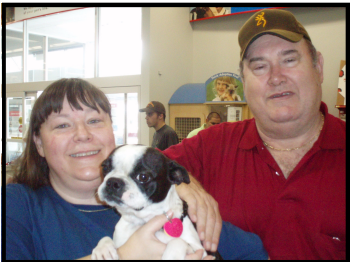
VALENTINE AND FAMILY ← _____