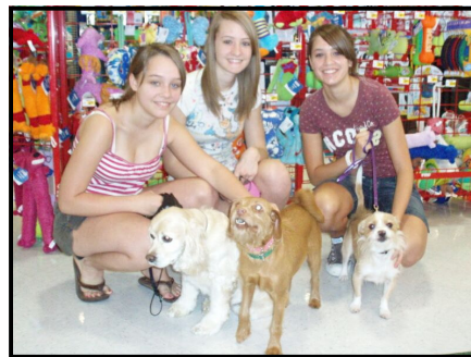
LITTLE RASCAL AND FAMILY