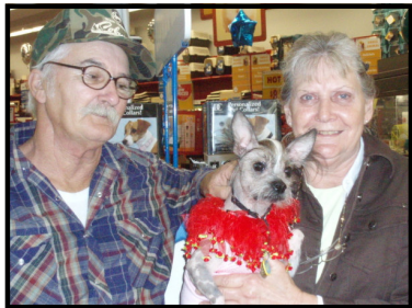
MONKEY AND FAMILY