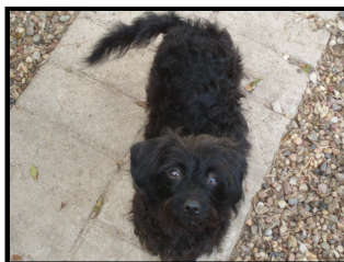
pregnant Jenny at intake