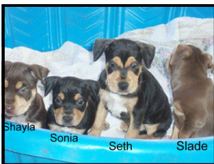
Sada's kids at 6 weeks