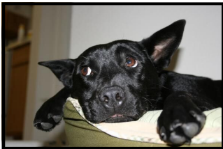
Bianca and those sweet girl eyes