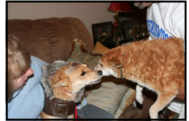
FOXIE AND ROXIE REUNITED AT LAST

“The only way to sum all this up is that this is a miracle and the best Christmas present ever !!! My husband asked me last week what I wanted for Christmas and I said FOXIE...not in my wildest dreams did I think that would be a reality..but it is ! :-)”