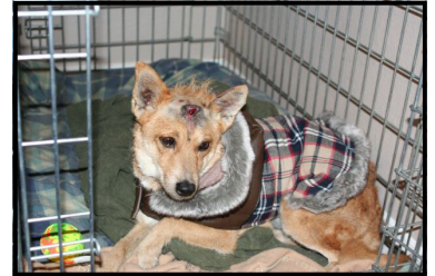
FOXIE RECUPERATING FROM HIS ORDEAL

We are all so relieved and thrilled Foxie is back in the loving arms of his Mom and Dad.