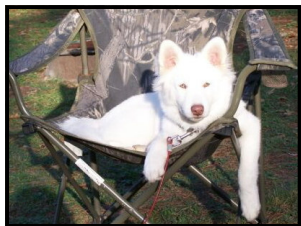
Koda now called Kodi relaxes on his family camping trip.