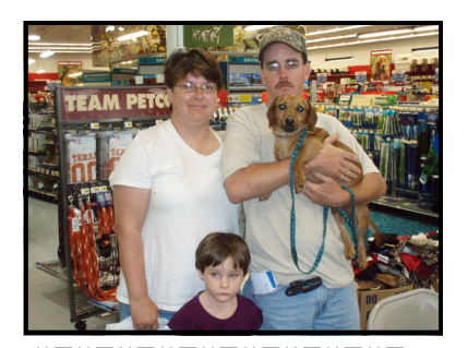
OTIS AND FAMILY